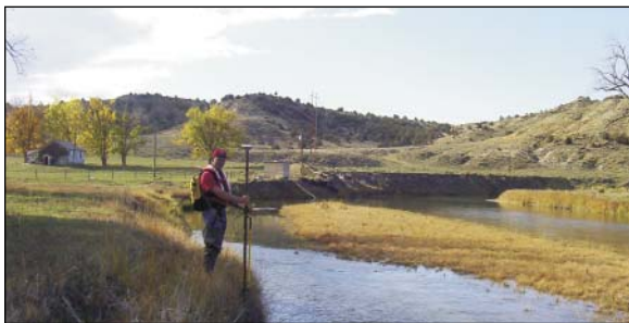
Tongue River at State Line, Montana (site 2, fig. 1).

Develop real-time SAR estimates and measurement techniques. Providing real-time SAR information will be addressed in two ways. First, statistical relations between specific conductance and SAR will be examined for each station (fig. 2). If these relations are statistically meaningful, real-time estimates of SAR will be generated from continuous specific-conductance data for each station. Second, recent technological advances have made possible the development of experimental instrumentation that can be placed in the field and provide automated measurements of the constituents (calcium, magnesium, and sodium) which are used to calculate SAR. One analyzer will be built, deployed, and tested during 2004. If that is successful, a second instrument will be deployed in 2005.